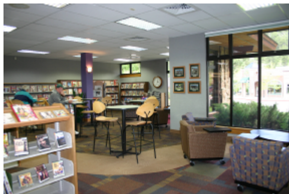
Community Gathering Place

It was truly a team effort with strong participation by the library staff, G3P and the contractor, culminating in the first patrons to enter their remodeled library who stopped as they entered and exclaimed “ WOW! ”.